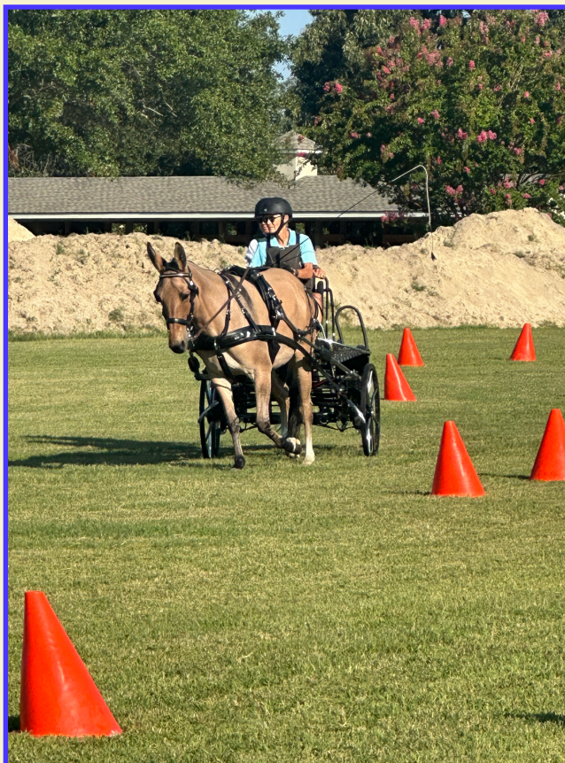
From the August 21st drive & brunch at the Vista!!