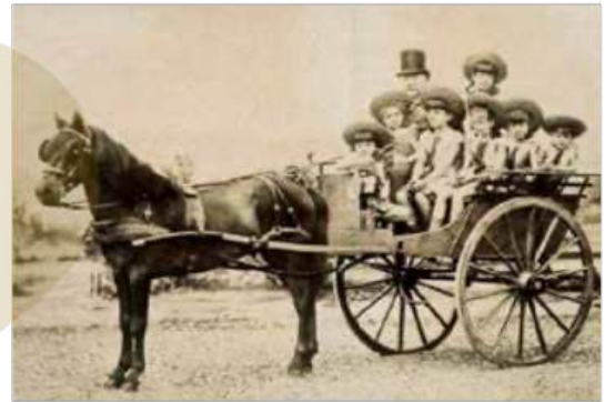
Tons of kids in village cart.